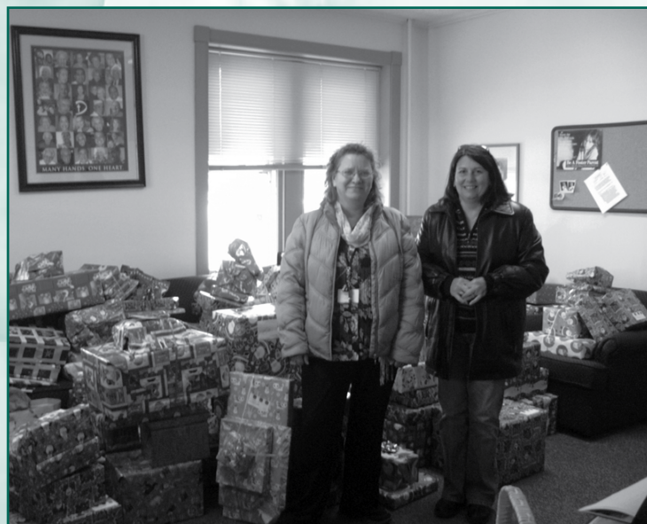
Staff from Buckeye Partners, L.P. in Breinigsville, Pa., stand among a mountain of gifts donated by employees of their company.

Local groups and Christmas gifts for Diakon Adoption &