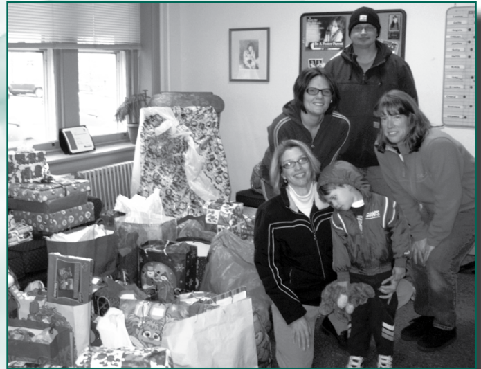
Staff and family of Concordia Preschool bring their annual donation to Diakon Adoption & Foster Care in Tipton.

Local groups and Christmas gifts for Diakon Adoption &