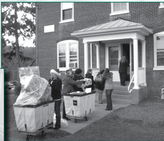
A group of employees from Air Products in Allentown delivers its annual gifts for children served by Diakon Adoption & Foster Care.