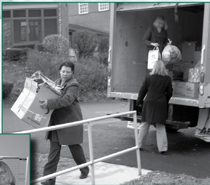
Diakon Adoption & Foster Care staff unload a truck with gifts for foster children from the Lehigh Mission District ingathering. O'Brien Moving & Storage Company assisted by providing a truck and a staff person to help. The mission district is a local Lutheran church jurisdiction.